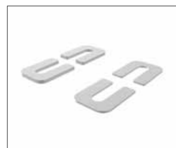
Shimset Used to adjust the height of X-Rail posts where the floor is uneven.