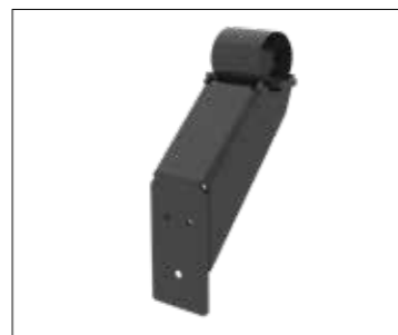
Handrail - Fitting With selfdrilling screw, 1 KIT