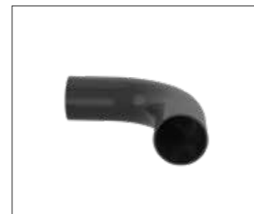
Handrail - Outer corner RAL 9011