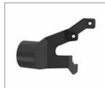
Handrail - End