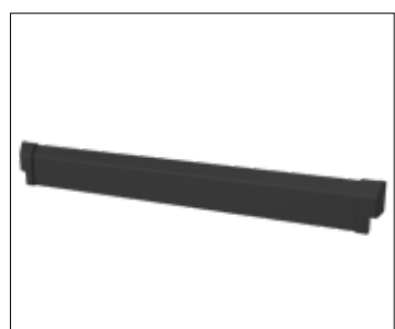
Kick Plate A kick plate is always included and available in length 1000 mm and 1500 mm.