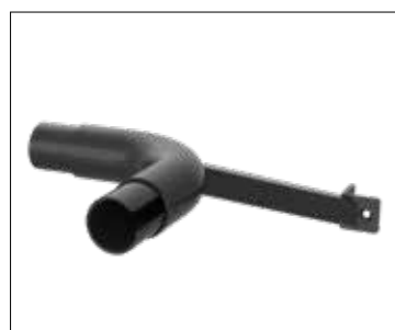
Handrail - Inner corner With support arm, RAL 9011