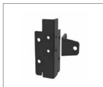
Kick Plate - Bracket Inner corner