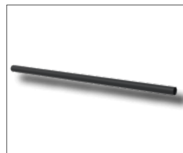
Hand- and kneerail Available in length to fit panels with the width 1000 mm and 1500 mm.